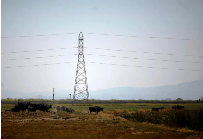
Smog blankets the Suisun Marsh as cows roam near Cordelia Street in Suisun City, Tuesday, Aug. 16, 2022.