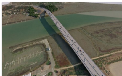
Caltrans looking to elevate Highway 37 between Vallejo and Marin County