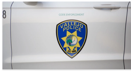
Vallejo City Council votes to bolster code enforcement