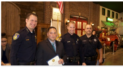
How badge bending became a ritual among Vallejo police