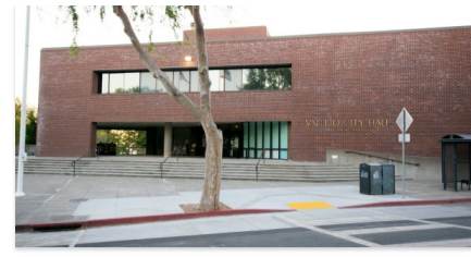
Vallejo City Council to reorganize government as revenue shrinks