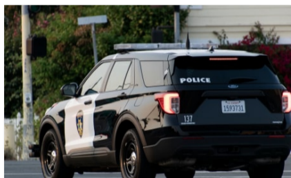
Vallejo police union ignored subpoena in Sean Monterrosa civil rights case, attorneys allege