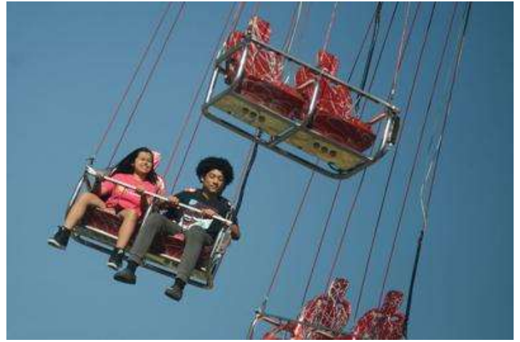
Fairgoers ride the Star Tower at the Solano County Fair at the Fairgrounds in Vallejo, Thursday, June 15, 2023.