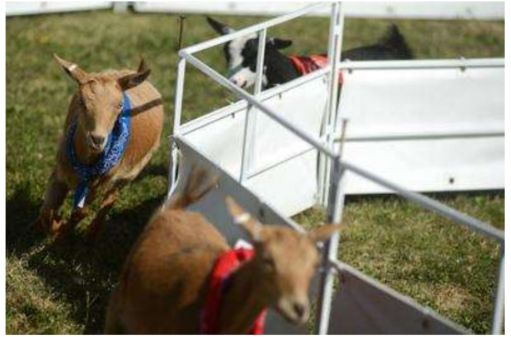
Goats compete in the All Creatures Barnyard Races at the Solano County Fair at the Fairgrounds in Vallejo, Thursday, June 15, 2023.